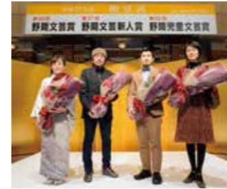
2015 Three Noma Awards Ceremony

■ The Noma Prize for Literature Sponsor: Noma Cultural Foundation Monetary Prize: 3 million yen