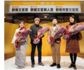
2015 Three Noma Awards Ceremony

■ The Noma Prize for Literature Sponsor: Noma Cultural Foundation Monetary Prize: 3 million yen