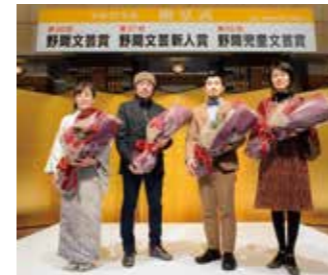
2015 Three Noma Awards Ceremony

■ The Noma Prize for Literature Sponsor: Noma Cultural Foundation Monetary Prize: 3 million yen